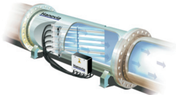
Hanovia Crossflow system capable of treating up to 10,000m 3 /hr