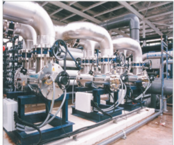
Bedok Effluent Re-use Plant, Singapore

UV permanently inactivates all bacteria, spores, viruses and protozoa (including Cryptosporidium and Giardia oocysts).